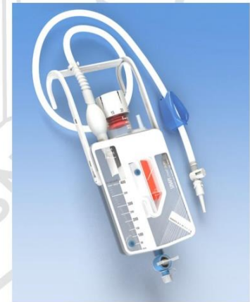
F. Sinapi drain system