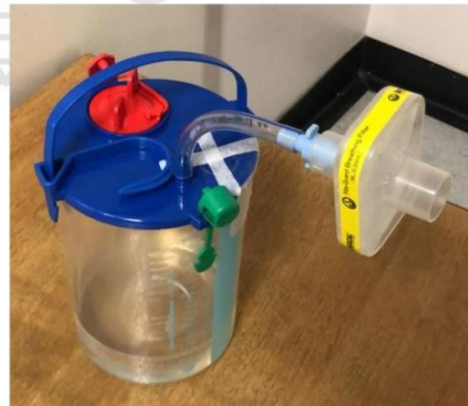
E. Filter system set-up connected to suction port / air vent