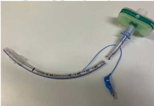
D. Cut ET tube connected to HME