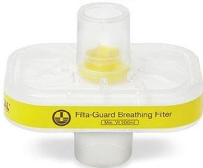
A. HME Breathing Filter