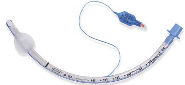
C. ET tube