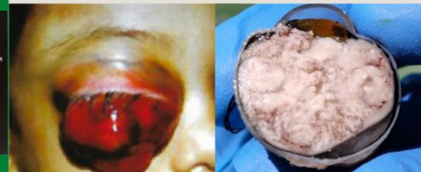
Tumor growing out of the eye

LATE DIAGNOSIS MAY LEAD TO REMOVAL OF THE EYE AND DEATH