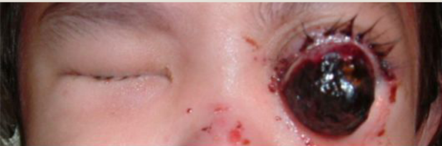
BULGING TUMOR, Left