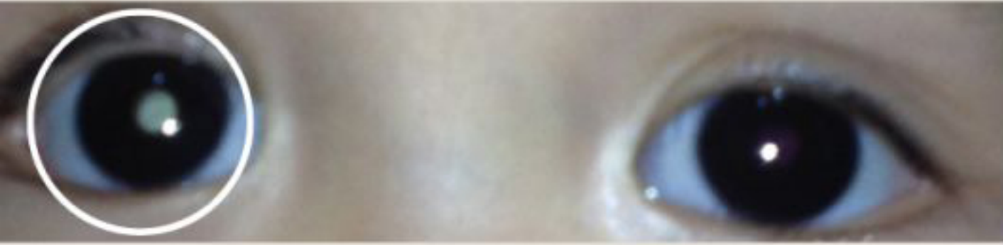
WHITE PUPIL, Right